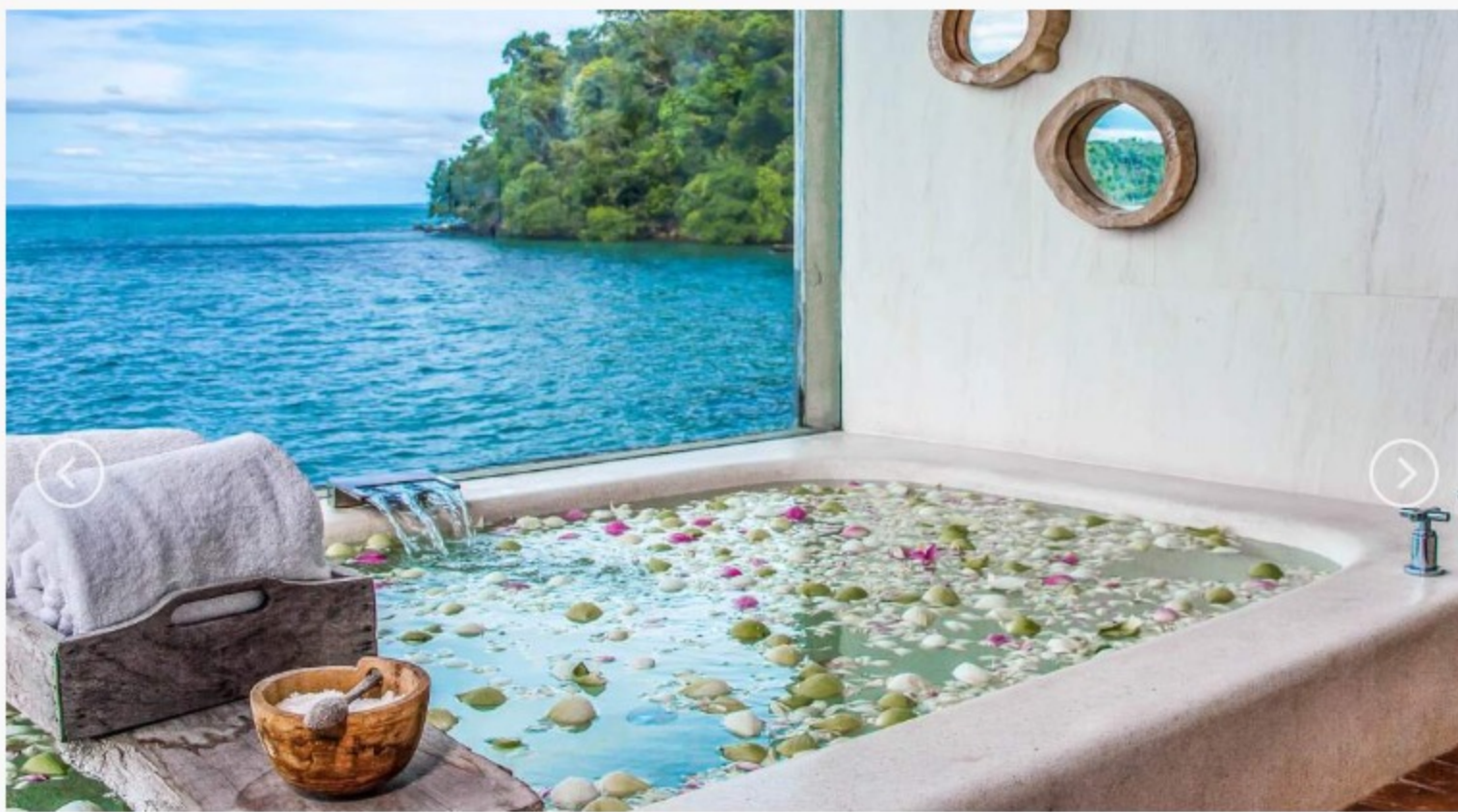
An oversized sunken bathtub at the Royal Villa on Song Saa Private Island